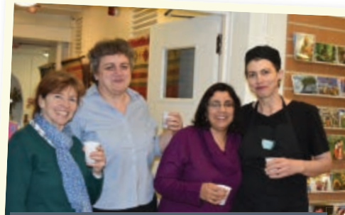
The staff in the City of Edinburgh Methodist Church & the Well Cafe have been very supportive of our move