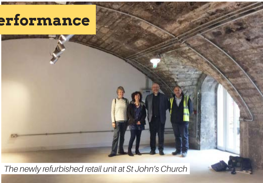
The newly refurbished retail unit at St John's Church